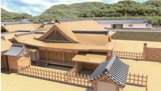
CG reproduction of San-no-Maru Palace (from VR Uwajima Castle)

lady of the house. In 1863, it was demolished and used as a training ground. In modern times, the moat was filled in and the area was urbanized. The stone walls at the foot of the mountain as the only remains visible remains.